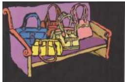
Purses in the Pew